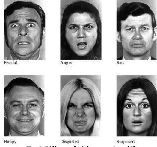
Fig. 1: Different facial expressions [4]

attitudes are expressed via the facial features [1]. Dampened facial expressions, avoiding direct eye contact are few symptoms of depression [2]. Ekman, a pioneer in studying facial expression has classified them as various states like Happiness, Anger, sadness, surprise, disgust and fear [3] which are given in figure 1.