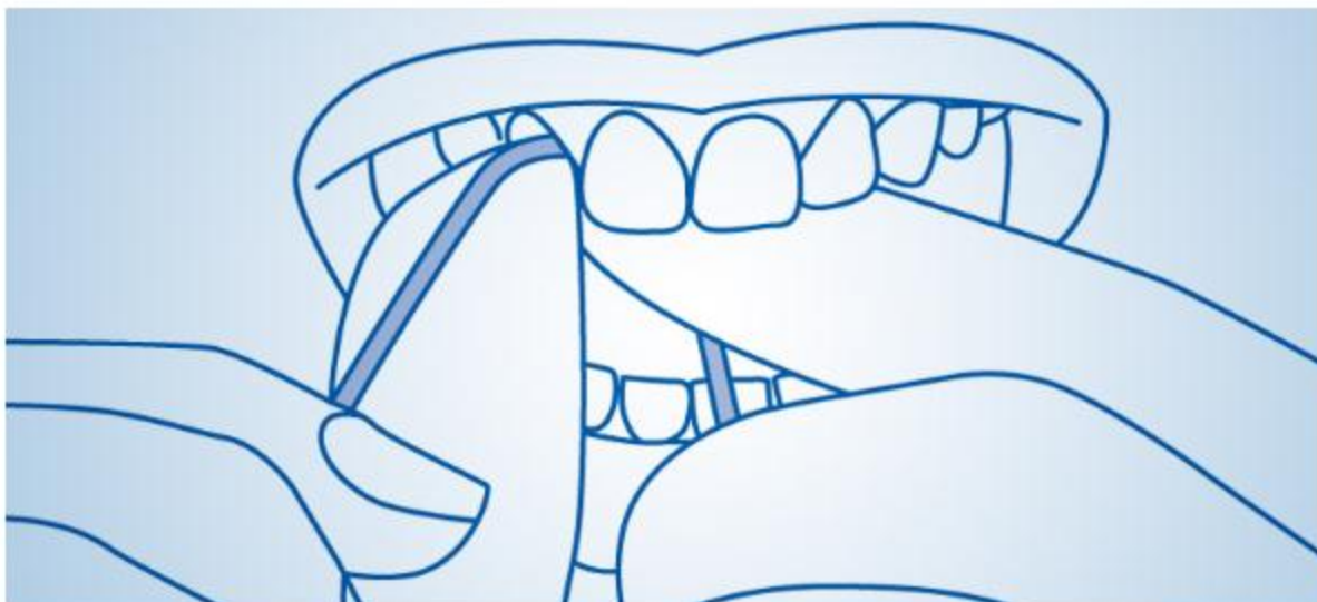
Figure 2: Biomechanics of Looped Dental Floss.

In addition, interleukin-7 is a multi-functional cytokine with organic exercises such as T cells multiplication, B lymphocyte separation, and boosting B lymphocyte expulsion of immunoglobulins (Ig), accusation to protein union at a severe phase, and activation of supplementary course. The ability of IL-7 to resorb bones, both without someone else and combined with different bone resorption operators, is of special significance. These effects are especially produced in cases of bacterial infection and are therefore equally essential for inflammatory periodontal diseases. In 2015, developers hypothesized that salivary degrees of IL-1ra and IL-7 may be possible markers of improvements in provoking profundity inspection and gingival discomfort. IL-9 is a strong chemokine with research on human granulocyte enlistment and incorporation and the intercession of explosive procedures. It may very well be discharged from various cells, like monocytes / macrophages, fibroblasts, lymphocytes, epithelial cells and endothelial cells. IL-9 carries on a big role in the neutrophil research manual. Researchers in 2016 connected the expansion in IL-9 from the point of view of periodontal disease, which is higher in constantly strong periodontitis and gum disease.[5]–[7].