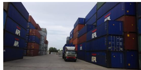
Figure 1. Storage Section.

Most of the container depot is divided into four sections based on the services. The particular flow of container movement is set and enforced by the container depot operator that helps to ensure the smooth container movement in the depot. It also helps to improve the process of loading and unloading container in the depot. The first section is storage section that stores good condition (AV) containers for short or long period. Figure 2.1, shows the storage section in container depot. After maintenance services, the containers are also stacked at this section until obtain the request from the shipping liners. The containers are stacked from 5 to 9 level heights using the reach-stackers. The storage section is also divided into several parts according to the shipping companies. The first in first out method (FIFO) is also adopted by the depot operator for stacking the container. It helps to avoid the prolong storage of container in the depot.