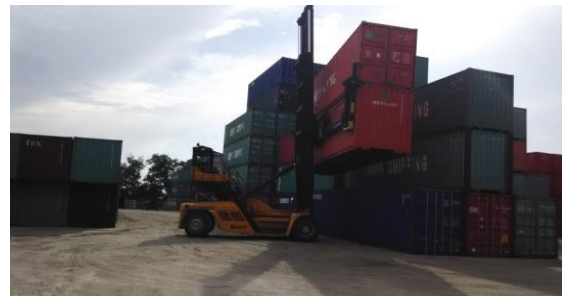
Figure 5. A of unit of heavy lift truck.

Figure 2.5, shows a container handling machine used in the container depot. The heavy lift truck improve the productivity of container depot that also allows high density block stacking up to 9-high. It improves the space utilization of container depot that increases the storage volume of container depot. These machines are equipped with single stacking spreader or double stacking spreader. These machines are allowed to lifts up to 8 containers high with single stacking spreader. Through double stacking spreader, the container can be lifts up to 2-over-6.