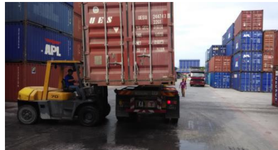
Figure 4. A unit of 7-tonne heavy duty forklift.

Heavy duty forklift trucks, lifts trucks, and reach stacker are widely used in the container depot. These container handling machines are one of the most flexible solutions to a small or medium sized container depot. By using these machines, the empty containers can to be moved or stacked quickly and efficiently. In Figure 2.4, it shows a 7-tonne heavy duty forklift is used for loading and unloading and for stacking in the depot. For example, it is also used to stack the empty container at washing area that usually stack up to 2-high.