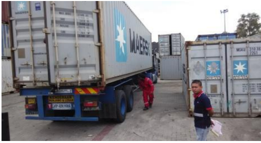
Figure 2. Maintenance Section.

container's owner. The damaged containers will be repaired and painted at this section once getting the approval. The containers will be stacking at the storage section after the maintenance process is done.