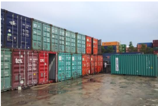
Figure 3. Washing section.

The cleaning section is one of the sections that help to wash and clean containers with chemical washing detergent. Figure 2.3, shows the cleaning section in container depot. After the inspecting process, dirty containers will be stacked in this section. The staffs will photograph and list out the cleaning service that also send to administration department. The container depot operator only precedes the cleaning services once the administration department gets the approval from the owner of container. Based on the type of stains, the different types of chemical washing detergent are used to wash the containers. For example, some stains request two or three time cleaning process for eliminating the stains totally.