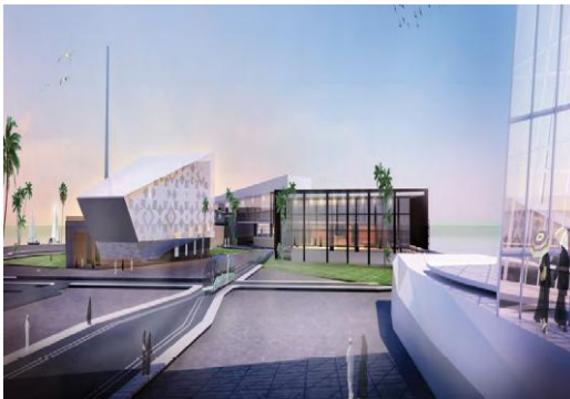
Figure 7. Side of the seaport terminal