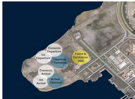
Figure 4. Zoning of the proposed site