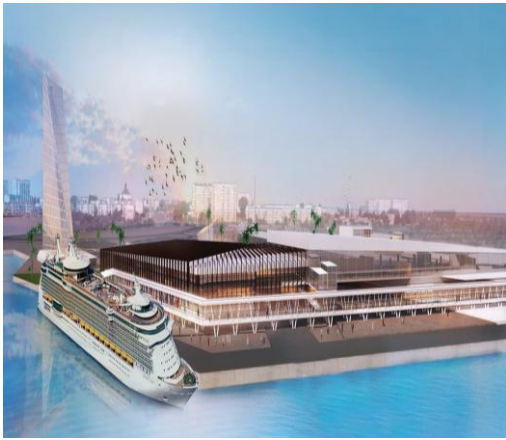
Figure 5. Overall view 1 of the seaport terminal