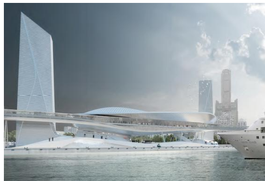
Figure 1. Kaohsiung Marine Gateway Terminal

Kaohsiung Marine Gateway Terminal is located at Taiwan (Figure 1). It was designed by Asymptote Architecture which was established from a partnership of Lise Anne Couture and Hani Rashid. The terminal is located between the city's hub and the port, and this contemporary statue-like building integrates the designed passenger experience and engineered coastal activity. The terminal facilities includes departure lobby, domestic arrival, international arrival, international waiting area, check in area, baggage claim and passengers loading bridge. Furthermore, it also has exhibition space, parking space, event space, two towers, administration offices and commercial zone.