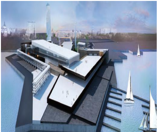
Figure 6. Overall view 2 of the seaport terminal