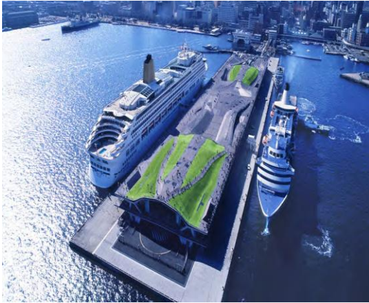
Figure 2. Yokohama International Port Terminal

Yokohama International Port Terminal is located at Tokyo Bay, Japan (Figure 2). It was designed by Foreign Office Architects. The main concept behind this project is to assert the site as an open public space, making the building's roof an open space extended from the two parks in Tokyo. The port is extended from the waterfront into the sea, making it more convenient for multiple ships to park on the port at the same time. The facilities of this port includes machine room, parking spaces, passenger terminal, entrance , lobby, customs, immigration and quarantine facilities, halls, rooftop plaza, outdoor plaza, visitor decks, and boarding bridges.