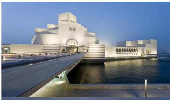
Figure 3. Museum of Islamic Art

Museum of Islamic Art is located at Doha, Qatar (Figure 3). This building was designed by architect I. M. Pei. This building has a gross area of 30600 m 2 . The Islamic Art Museum is intended to represent Islamic architecture and preserve Qatar's traditional architecture that has lost its identity through the contemporary revolution. It has a collection of Islamic antiques and works of art, library, places of research, restaurants, and auditorium. The form inspiration came from ' Sabil ' the Ibn Tulun Mosque ablution fountain in Cairo, Egypt in the 9th century. The architect discovered simplicity in the daytime, with the shade and shadow produced from the cubist geometric, the ablution fountain of Ibn Tulun comes to life. The museum has two main zones which are exhibition zone and educational zone that include galleries, offices, library, reading and studying spaces, classrooms and workshops, auditorium, technical and storage facilities, parks, café and restaurant, shops and playgrounds.