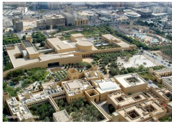
Figure 1. King Abdul-Aziz Historical Center

King Abdul-Aziz Historical Center is located at Riyadh, Saudi Arabia (Figure 1). This building was designed by several architects such as Albert Speer & Partners, Omrania & Associates, Rasem Badran and Ali Shuaibi. This building has a gross area of 32700 m 2 . The King Abdul-Aziz Historical Center is an urban project that incorporates green cultural and urban infrastructure. The primary element is the museum, intended to create visitors interactive with informative exhibits through multimedia technology. The divisions of the site are the national museum, conference, library, paperwork and study center. In addition, there is a conservation site for a group of mud houses as prototypes of the region's vernacular architecture. The main project concept is to create and develop the social interaction and cultural awareness of people through the public spaces and parks beside the urban context of the project. The project is integration between the landscape and the building area which includes public park, national museum, antiquities and museums agency, Al-Murabba Palace, traditional buildings, Darat Al-Malik Abdul- Aziz, King Abdul-Aziz public library, King Abdul-Aziz mosque, and King Abdul-Aziz auditorium.