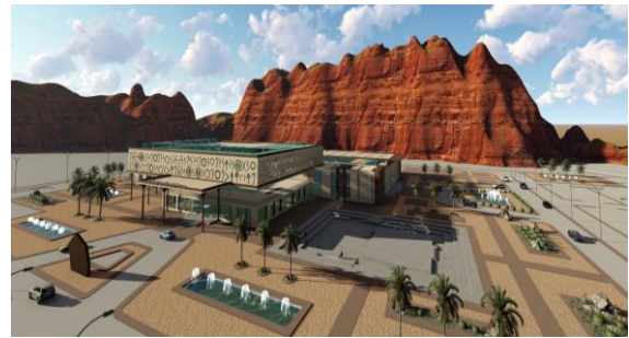
Figure 7. Overview of the interactive house for arts and crafts

Likewise, the studio was designed to face the Ikma mountain to create a natural view from the arts house. Moreover, courtyard was created for natural daylight and ventilation as this is a traditional feature in Al- Ula buildings. In addition, horizontal louvre has been developed in the south to avoid perpendicular sun radiation that will generate shading and decrease energy consumption. In terms of sustainability features, the building has incorporated solar panel, green roof, courtyard, double skin layering, daylight usage and shading device. Figure 7 to Figure 10 shows the proposed design of the interactive house for arts and crafts.