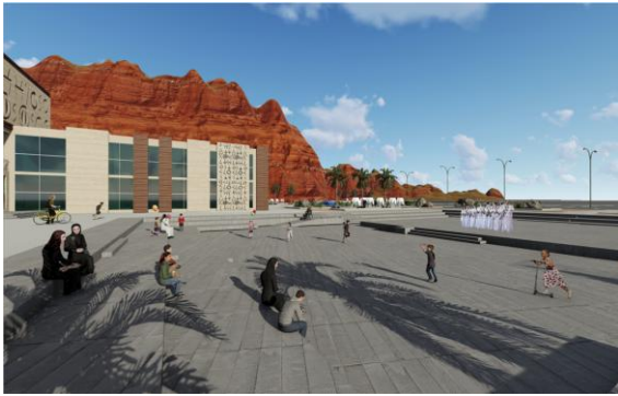
Figure 10. Amphitheater for occasions and socializing