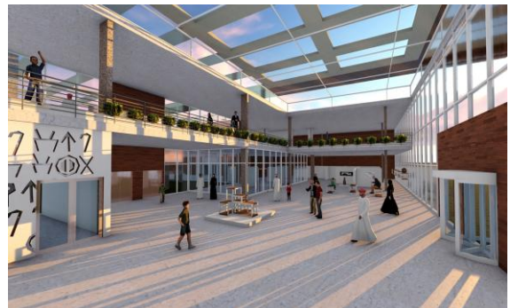
Figure 9. Public entrance and exhibition area