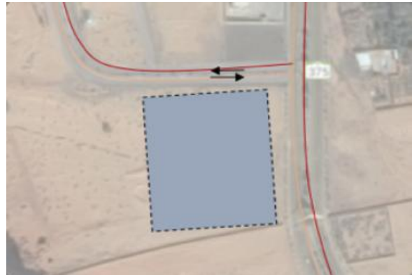
Figure 4. Site 1

For Site 2 (Figure 5), this site is located near the historical Ikma mountain (Library of Lahyan Kingdom).This site has an estimate area of 25000 m 2 .