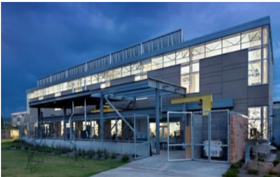
Figure 2. University of Wyoming - Visual Arts Facility

University of Wyoming - Visual Arts Facility is located at Laramie Wyoming, USA (Figure 2). This building was designed by Hacker and Malone Belton Able PC. This building has a gross area of 7198 m 2 . This project consolidates the fine arts program of the University from its scattered region all around the campus, tending to restrict the prior equipment while at the same moment providing recourse to professors and students with encouraging their research in the fine arts. The building is intended to be state-of - the-art, competitive, affordable and flexible enough to acknowledge program and technological evolution. The building is intended to be state-of - the-art, competitive, affordable and sufficiently adaptable to further acknowledge technological development of the program. The Visual Arts facility is a key component of the campus's new arts boundaries. The building is intended to be equally engaging, permitting occupants to experience the outdoor environment from within while the same time duration in creating quality interior experiences. The main building components are educational facilities which include art studios, classrooms, offices, public spaces and services.