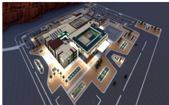
Figure 8. Top of the interactive house for arts and crafts