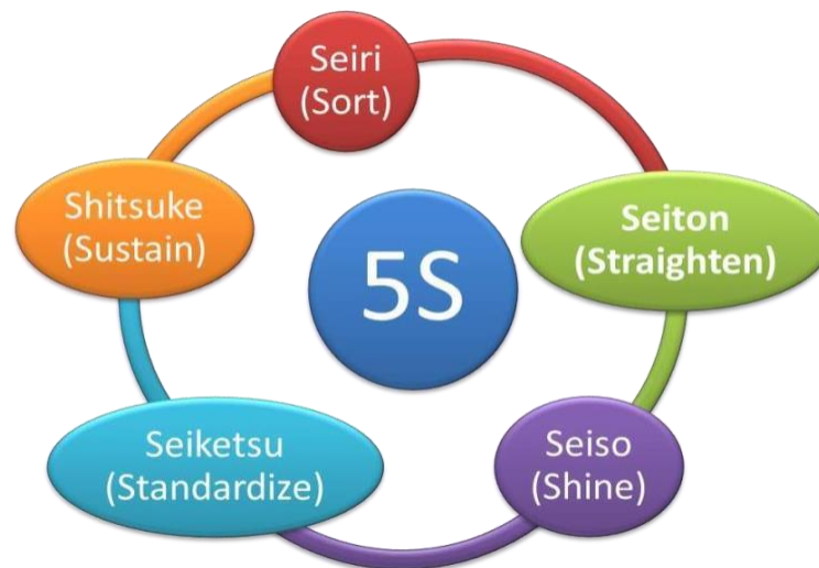
Fig: The 5 'S' Methodology