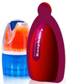
Fig. 3: Tap the Cap [26]

Tap the Cap, as shown in fig. 3, is a dispensing cap which is "stand-alone". It can fit any water bottle worldwide with a diameter between 26 mm–32 mm, so the consumer can stay loyal to his favourite brand of bottle water and can have "health-on-the-go" [26].