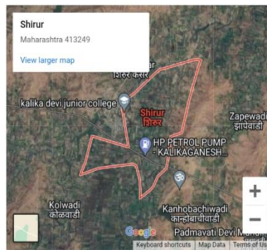
(Fig: 1) Map of the study area

Beed is a significant district in the state of Maharashtra's Marathwada area. It is bounded to the north by Aurangabad and Jalana, to the east by Parbhani, to the southeast by Latur, to the south by Osmanabad, and to the west and south by Ahmadnagar. Its northern limit is 18^{\circ}28' to 19^{\circ}28' , while its eastern limit is 74^{\circ}48' to 76^{\circ}45' in longitude. Beed town is the seat of authority for that district. Beed, Georai, Patoda, Ashti, Shirur (Kasar), Ambajogai, Kaij, Majalgaon, Dharur, Parli (Vajjnath), and Wadwani are the eleven tehsils that make up the greater Beed region for administrative reasons. Our current examination focuses on one particular tehsil (out of a total of eleven): shirur kasar tehsil Kasar (Fig: 1)