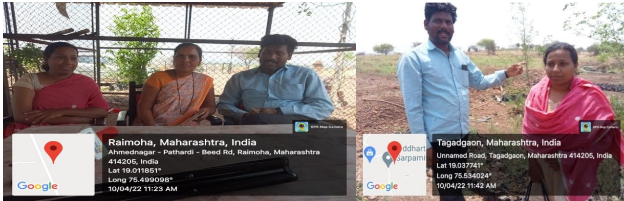
(Fig. 2: Personal interviews and talks with local residents)