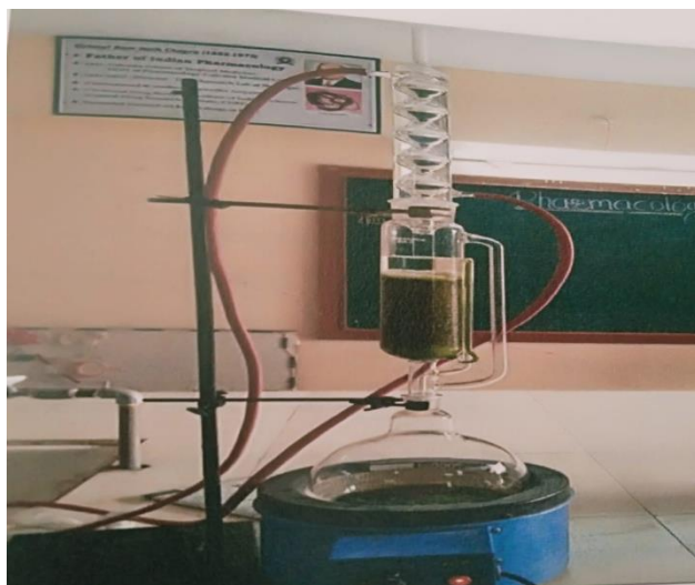
fig.No.01: soxhlet extraction leaves of Merremia dissecta

The leaves of Merremia adissecta was thoroughly rinsed with water and shade dried at room temperature in hygienic condition. The leaves of Merremia dissecta was powdered manually and extracted with methanol using soxhlet extraction technique. Extraction was performed until the cycle periods of 48-72hr.and solvent become colourless. The methanolic extract was concentrated using rotary evaporator and stored for further use.percentage yield of after extraction 14.95 W/V.