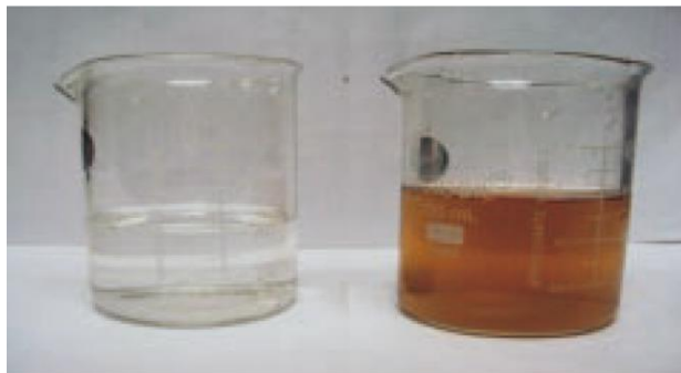
Fig.No.02 : Preparation of Herbal Nano particle.

The synthesized merremia dissecta silver nanoparticles were separated by centrifugation using REMI centrifuge at 5000 rpm for 15 minutes. The supernatant liquid was discarded and the pellets were collected stored.