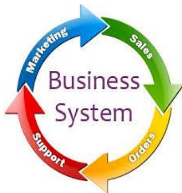
Fig.1: Business system

business will generally leave you feeling a small amount overcome. The area unit your own personal goals area unit you continue to inquisitive the way to realize the life-style you unreal of once you commenced to become a business owner? You recognize the area units things to be done, however you are not certain wherever to start.