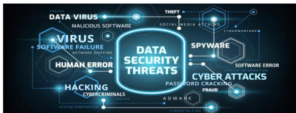
Fig. 2: Process of Data Security Threats

Every person who's walking a business is additionally in possession of any data regarding the industrial enterprise itself. A number of the industrial enterprise statistics is employed for danger mitigation, revenue improvement furthermore as normal improvement of the business. By means that of the sole truth that facts will generate