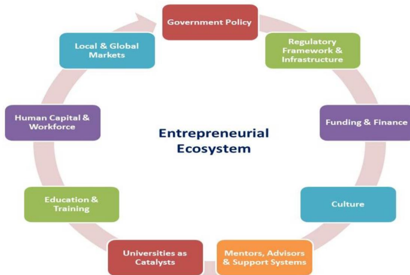
Fig.1: Entrepreneurial Ecosystem

As in the social entrepreneurship is an important concept in today's life and it has most attention in all sensible levels of system as well as theoretically. It has different ways of explanation in all sensible areas. It is important for achieving goals in all enterprises due to their recent activities and performance in the social entrepreneurship area and also it covers all business related activities multidimensional. There are always given a mission in any enterprises for making economic growth of company and for this it lies on lots of stress for completing task to achieve goals. The principles of execution in the term of business management is important for achieving a goals in the social enterprises for money growth and it is also important to solve social issues in this entrepreneurship. These issues can be solve by utilization of now innovations in the product of services as well as in new economic markets.