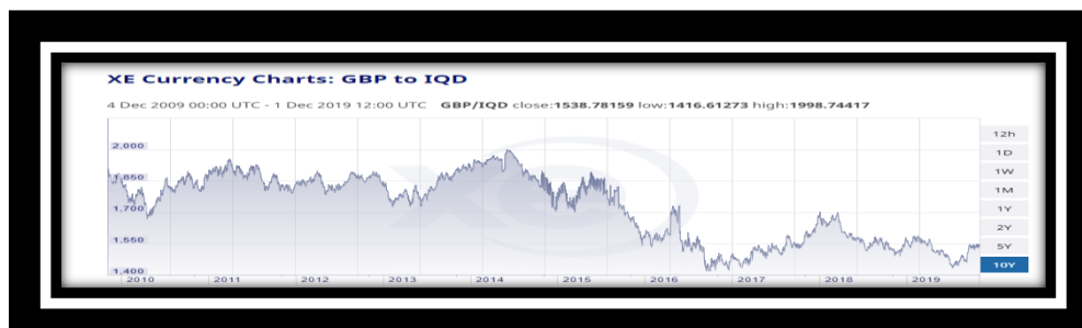
Fig.1: shows movement of the exchange rate of Iraq Dinar against the UK pound from 2010 to 2019.

Agreement (TIFA) and the Partnership and Cooperation Agreement with the European Union in 2012. Furthermore, Exports in Iraq increased to 87260 USD Million in 2018 from 57559 USD Million in 2017. Exports in Iraq averaged 38475.53 USD Million from 1988 until 2018, reaching an all-time high of 94209 USD Million in 2012 and a record low of 1720.40 USD Million in 1994. Openness to trade and investment is improving, and taxes are low. Yet, the classification of Iraq progressive in all international reports, including The World Bank report on the ease of doing business, the Republic of Iraq is in the Middle East and 43 globally among 183 countries, indicating that the Republic is from the top five countries in the world in doing economic reforms during the past five years. However, the Iraq economic influenced by external factors such as world demand, international trade, exchange rate, and etc... . Even though, the Iraq currency (Dinar) is pegged to the US dollar at US$1 = ID1200 However, this study investigates the relationship between the Iraq Dinar and UK bound which is freely floating. Here in this study the exchange rate between the Iraq Dinar and UK bound is measured to see its effect on export from Iraq to UK.