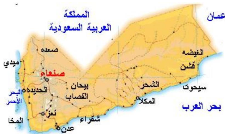
Fig 1: Sanaa City's Geographic Location