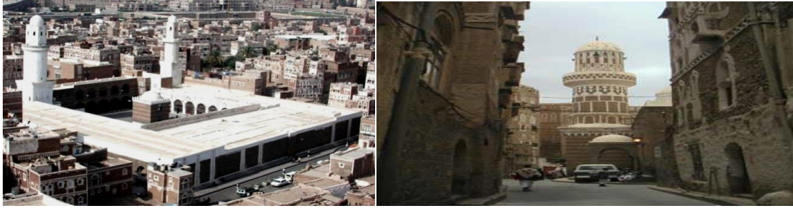
Fig 2: Sana'a mosque

Social and skeletal structure: The Yemen Arab Republic was formed in 1990. The main part of the social structure of country is tribal, and the tribes are the major and structural foundations of the government ( www. Muslim heritage. Com , Rohab, Soaud, 2017). By attendance of Islam in Yemen, the Islamic symbols such as mosques, bathrooms, markets, and the special architecture developed and caused a significant economic and architectural growth in various sections of country (Madbouly, 2008). The overview of Sana'a had also not been organized stochastically, and there was a special planning and architecture in organization and formation of the buildings (Almadhaji, 2007). Before Islam emergence, Ghumdan palace was one of the prominent stages of the development of Sana'a city which may be considered as the first city core initially. In different Islamic eras, the contexts of Sana'a's cultural heritage have been maintained illustrating its importance as a global cultural heritage. Indeed, the main