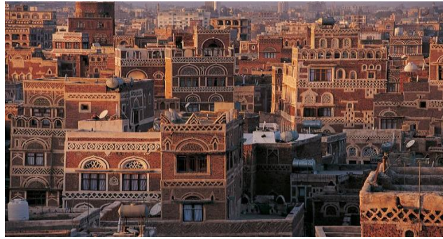
Fig 4: Sana'a House

Mosque: It is the first place outside Saudi Arabia where Islam was introduced. The most important treasure remained since the Islam emergence era outside Saudi Arabia is the great mosque of Sana'a which is one of the oldest Muslims' mosques in the Islam world where the greatest religious and historical documents of Quran are observed. The mentioned mosque is among the elements of seventh A.H. century and the most ancient version of Quran is considered as the greatest Islamic treasury of the Yemeni city. It is located in the middle of the old section (Harvard Karmer, 2015). In Sana'a city, mosque plays an important role as an educational and cultural center in the society. From social viewpoint, the serious issues and problems of individuals of society are solved in mosques instead of courts. Also, in this holy place, the wanderers and travelers are fed and sheltered. In the society of Yemen, mosque acts as a place for holding cultural events, and it is used for acts like marriage, separation, and funeral (Ahmad Haidar & Taleb, 2013).