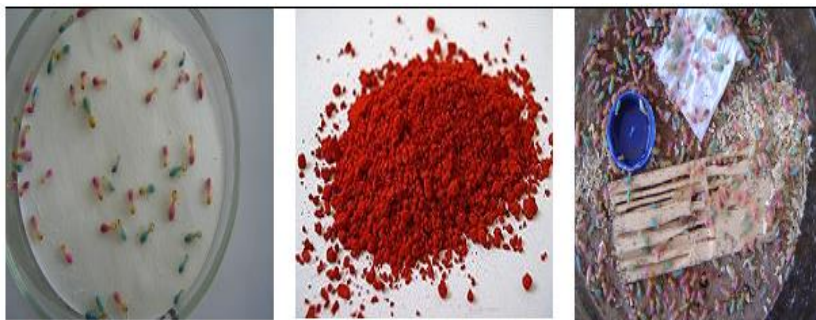
Fig. 2. C_{15}H_{17}N_4Cl – red and C_{20}H_{20}N_3OCl chloride – blue

– red and C_{20}H_{20}N_3OCl blue dyes or dyed based on feeding dye-soaked filter paper. (Fig. 2).