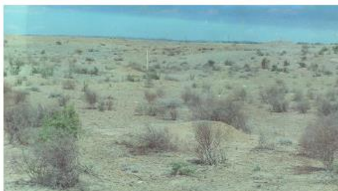
Fig. 2. Experimental site at “Shaih bobo”, Khiva district

According to the results of the research on interrelation of 8 termite mounds which were located 100 meters far away from each other (Fig. 3), it was observed that the workers from mound 1 were in friendly relations with those in mound 2 ( H_1 \pm H_2 ), but with the workers of other termite family they were aggressive ( H_1 \times H_3, H_1 \times 4, H_1 \times H_5, H_1 \times H_6 ), especially the workers in mounds 7-8 ( H_1 \times H_7 and H_1 \times H_8 ) were extremely aggressive (Table 1).