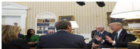
مشاور ترامپ: امریکا به برجام پایبند خواهد بود