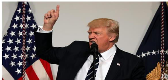
Fig. 1: Sample News about US and its Persian version

Figure 3.1 provides an example of the US' news extracted from Press TV and its Persian translation on the same website. Looking at the English and Persian titles, one notices the application of labeling as a reframing strategy. In the English version, the expression "Iran nuclear deal" is used which means "توافق هسته‌ای ایران", but it is expressed by using "برجام" in its Persian equivalent. Application of "برجام" as the abbreviation of "برنامه جامع مشترک" (or joint comprehensive plan of action) in calling the deal might be an ideological sign to reduce the load of "authority" felt in "Iran nuclear deal". Using the second term gives the impression of being less powerful. In other words, the expression "برنامه جامعه مشترک" makes the audience feel positive toward the whole story.