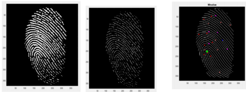
Figure 2: Original image after applying local and global histogram matching