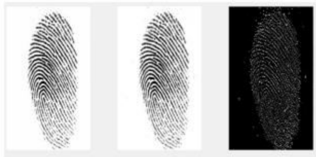
Figure 1: Bio metric finger input and output histogram

The histogram matching is programmed model and each calculations are depends with biometric finger pattern. Our proposed method has performed unique finger impression enhancement and particular extraction. The vision of input images and edges are converted to unique mark images. Details are extracted by using pre-processing, extraction and matching methods. Image enhancement has clear and simple method to mark unique images. This method has cutting of images and acquire the detecting patterns. The scanners are considered for assessing quality factor and verify the precision rate.