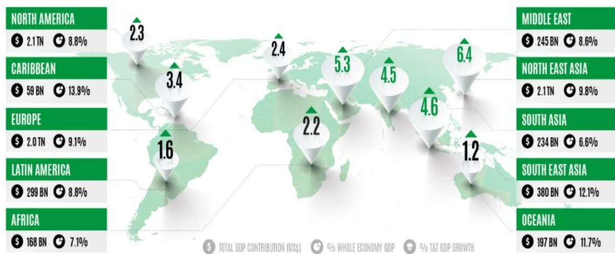
Figure 1.1: Travel & Tourism sector performance in (2019), Source: World Travel & Tourism Council (2020)

In 2019, Travel & Tourism’s direct, indirect and induced impact accounted for: