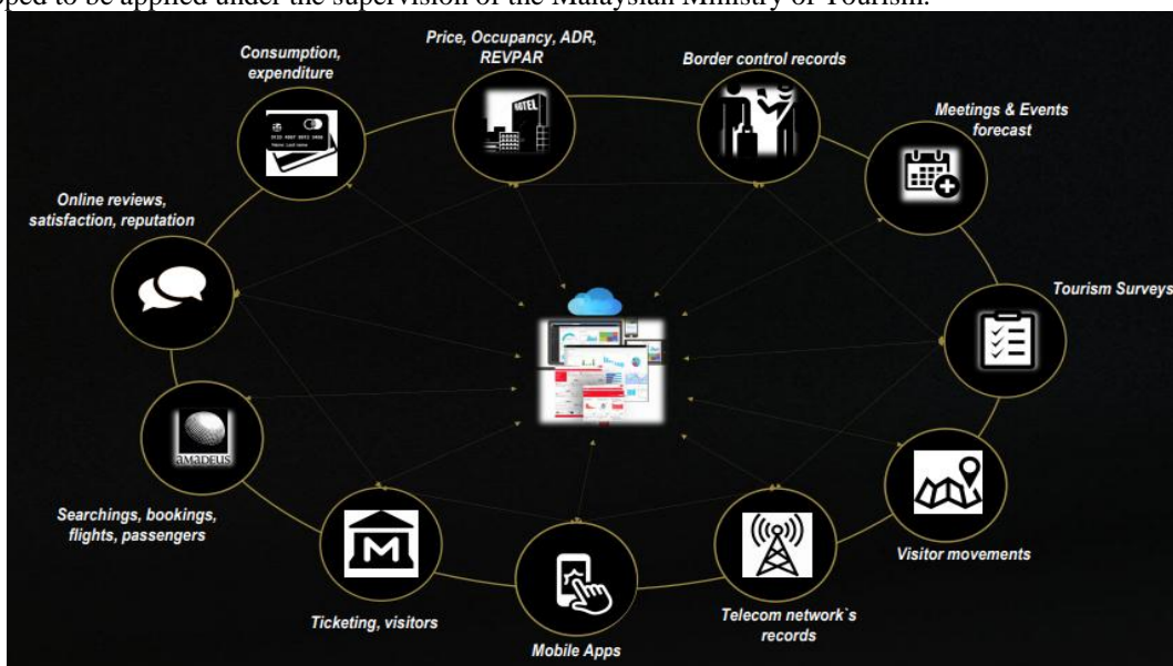
Figure: 1.3 Smart Tourism Marketing Through Smart Phones, Source: Kulshrestha, (2019). CONCEPTUAL ISSUES ISLAMIC SMART TOURISM CONCEPT

For example, Figure: 1.2 shows the activity of tourists coming from Arab countries within the cities of Malaysia using hotels and transport, brings benefits to the Malaysian economy. Furthermore, the Figure, 1.3 can be developed to be applied under the supervision of the Malaysian Ministry of Tourism.