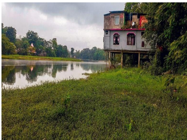
FIG 4: CONSTRUCTION ON THE WETLAND IT