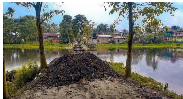
FIG 3: CONSTRUCTION OF BRIDGE