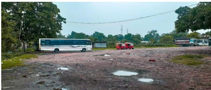
FIG 2: CONSTRUCTION OF BUS STAND ON IT