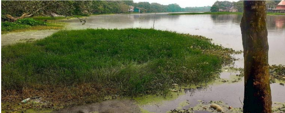
FIG 1: DEGRADATION OF WATER

Due to the more human encroachment some portion of the wetland is disappeared. For his own benefits people construct a no. of bridges, culverts across the wetland leading to the fragmentation of the wetland into small segments. A decade ago, a bus stand was constructed on the wetland by filling a considerable portion of it. All these leads to the disappearing some portion of the Morikolong wetland.