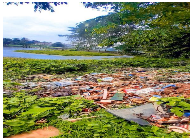
FIG 5: GARBAGE SITE ALONG