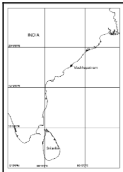
Figure 1: Study area.

The operation of strong-pressure (low and depressive) monsoon systems throughout 2009 are very low compared with previous years. Over the season only two depressions and four low-pressure areas developed over the Bay of Bengal (IMD end-of-season report). One of the deep depressions in Bengal's Bay of Northwest (NW) pushed west-west. On September 5-7, 2009, a depressed depression was developed over the Bay of Bengal on the Coast of Orissa, initially shifting the NW Wards and then west-northwest and reaching the northern Coast of Orissa at 21.5° N and 87.5° E, some 640 km from the study region. In this analysis, the southwest monsoon wind and swell characteristics are posed off Visakhapatnam, East Coast of India. The direction of the field of research is shown in fig (1). The Coast is associated with nearly identical bathymetry contours offshore in the west-south-west and east-north-east. The shoreline characterises diverse forms of sediment, such as grain sand, dispersed rocky crops, rocky protrusions and sand dunes, etc. The tides in this field are half-diurnal, with a typical spring mare range of around 1.43 m and a neap mare range of 0.54 m.