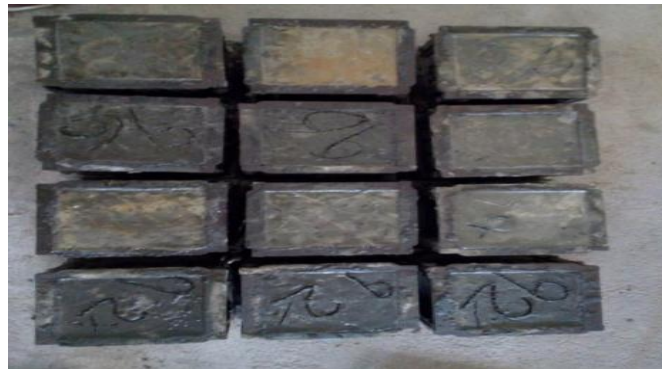
Table17: Fresh properties test results

The cubes are casted with the same mix proportion and placed at a temperature of 27°C and 90 % humidity for 24 hours. Then the cubes are demolded and placed in clean water till the date of testing.