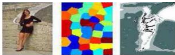
Fig.13. Perceptual Image Segmentation Algorithm

F) Image Segmentation (also known as image segmentation): Images are segmented for a number of purposes, the most essential of which is to split them into segments that are closely linked with the things or areas of the real world that are shown inside the photograph. During image processing, the significant pixels in a picture are separated from the rest of the image's pixels, which is known as segmentation. A picture segmentation algorithm provides a collection of segments that together cover the whole image, or a collection of contours that are recovered from the image.