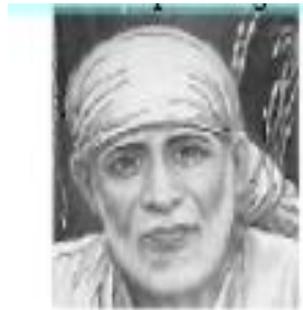
Fig.2. GRAY Image Format

Images of the following sorts are available: There are four distinct types of photos to choose from: High-intensity images - A high-intensity image is a data matrix whose values represent high-intensities that fall within a certain range of intensity. An intensity picture's elements belonging to the uint8 or uint16 classes have integer values in the ranges (0, 255) and [0, 65535], respectively, when the integer values are examined. As an additional benefit of being a member of the double-class, the values associated with the image may be expressed as floating-point numbers. Conforming to popular thinking, the range of pixels for intensity photographs with scaled, class double data types is from 0 to 1. For the purposes of MATLAB, an intensity picture is stored as a single matrix, with each element of the matrix representing one pixel of the related image.