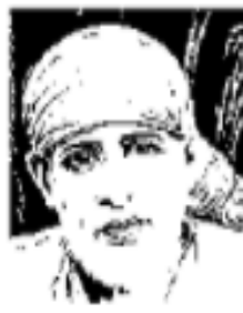
Fig.3. BW Image Format .This gives image in Black andWhite.

0s and 1s are represented as binary images in computer programming, and they are used to represent numbers in a logical array. Pixels with the value 0 are displayed with a black background, while pixels with the value 1 are presented with a white backdrop. Following the specifications of the MATLAB language, binary pictures must be classed as belonging to the logic class, which is why intensity images that contain just 0s and 1s are not classified as binary images[6].