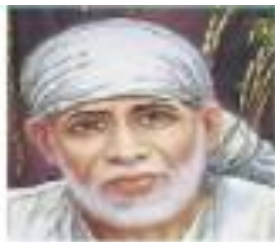
Fig.1. .JPG Image Format