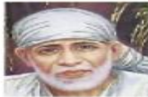
Figure 5: RGB Image Format

Image with three colours (RGB)- An RGB picture, often known as a true-color picture, is a kind of image that includes three colours. In MATLAB, these images are stored in the form of an m-by-n-by-3 data array, with the red, green, and blue components of each pixel specified by the red, green, and blue components of the data array that contains the image. The colour of each pixel is determined by the combination of the red, green, and blue intensities stored in each colour plane at the pixel's location, which are stored in each colour plane at the pixel's location, and which are stored in each colour plane at the pixel's location. Images in RGB format are saved as 24-bit images in graphics file formats, with each of the red, green, and blue components carrying eight bits of information. It is conceivable for an RGB array to belong to the double, uint8, or uint16 classes, depending on the kind of data it contains. 0 is assigned to each colour component of an RGB array of type double, while 0 is assigned to the whole array. Whenever the colour components of a pixel are (0,0,0), it is shown as black; otherwise, it is displayed as white (1,1,1). It is recorded in the third dimension of the data array, which runs along one of the third dimensions of the data array, that each pixel has three colour components stored in it.