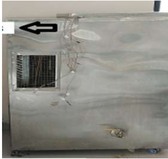
Figure 2: Photo of the Milk chilling system with cold thermal storage