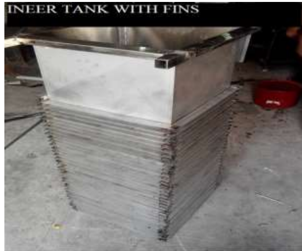
Figure 1: A photo of the Fins attached to Brine cum PCM Tank