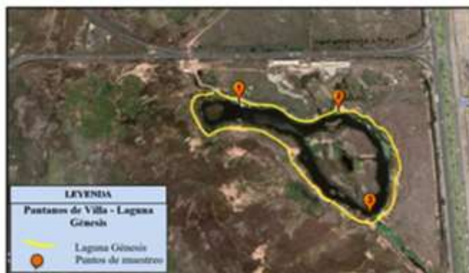
Figure 1: Study area.

The study area of Los Pantanos de Villa is a protected natural area that is located on the coast of the Chorrillos district in the province of Lima, department of Lima, in Peru, with an area of 2.63 km 2 and has a degree Protection of Wildlife Refuge as shown in figure 1.