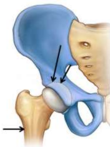
Fig. 2. Draining osteoperforation of the roof of the acetabulum (diagram).

The second group consisted of 81 (60.4%) children who had an autopsy performed by the method of draining osteoperforation of the acetabular roof (DOKVV) (patent for invention RUz IDP No. 05082) (Fig. 2).