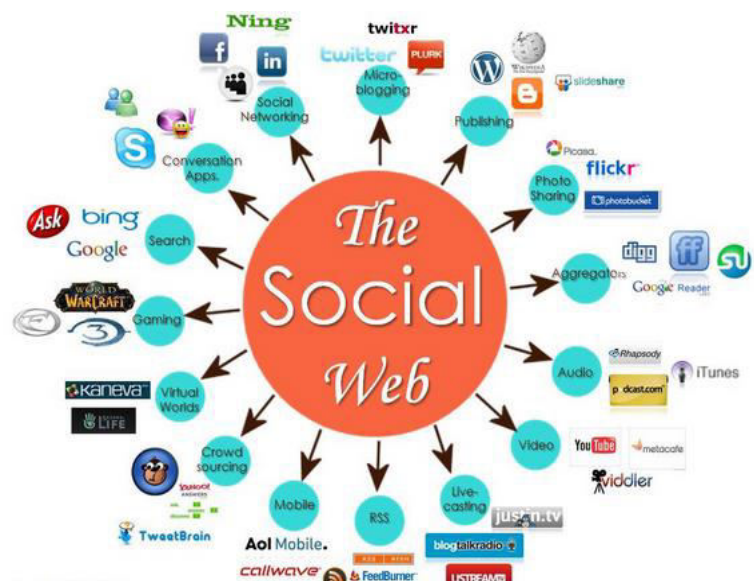
Fig.1 Different Social media in Current Market

Social network is nothing but an internet based software application which allows family members, friends, colleagues, clients connect to one other to share information like photos, videos, messages, Documents, Location etc altogether it changes entirely the way we are communicating. In recent years the popularity of social media increases drastically throughout the world. Even it is reaching to common man , uneducated persons also can able to use these social media comfortably. Here information exchange is very fast with in no time any information can reach throughout the world. Various kinds of social media available in current market are shown in Fig.1.