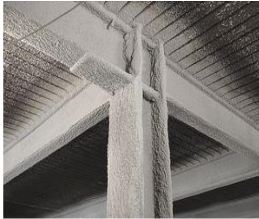
Figure 1. Spray-applied Fire-Resistive Material