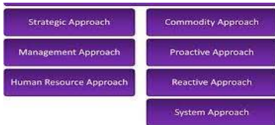
Figure: 2 Approaches Of Human Resources Managements

HR the executives hypotheses can be characterized as the board speculations that help a singular's information, abilities, resources, and encounters that offer some incentive to a business (Cohen and Olsen, 2015). Possibility hypothesis, institutionalism, and the asset based view are a portion of the HR the executives speculations connected with the CBHRT. Hypothesis of possibility The possibility hypothesis is one of the theories that supports CBHRT.