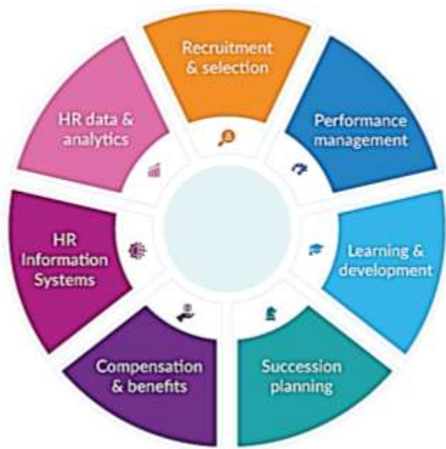
Figure: 2 The Following Are The Key HRM Processes

d) Training and Development: Recruited candidates receive training and brush up on their skills in order to be more effective in their employment and deal with potential obstacles.