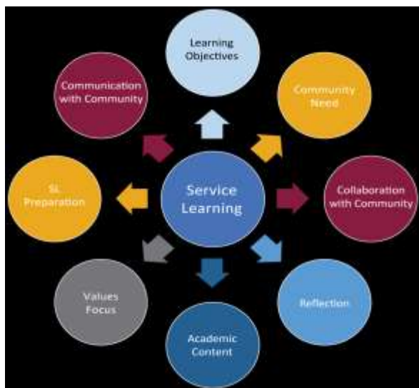
Figure: 3 Instrument Development