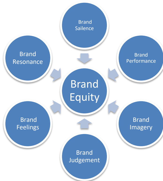
Figure 2: The conceptual research structure of brand equity for this study