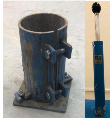
Figure 2. The mold used in preparing the specimens and the rambler that was tamping the mixture.

Used Equipment'S A cylindrical mold with a diameter of 100 mm and a height of 200 mm was selected to determine the compressive strength following the ASTM C39 standard [17]. Molds used in preparing the samples are shown in Fig. 2. The mixtures were filled on layers where each layer range from 3 to 3.5 cm. The ramming process is done manually 25 times for each layer using a rambler that has a 2.5 Kg weight and dropped from a 35 cm height. The specimens to be tested were extracted from the mold after 24 hours. Then they were cured for 7days at room temperature. The specimens were tested using a universal test machine as shown in Fig. 3 with a speed rate of 1 mm/min. Fig. 4, shows a specimen under the compression test and after the test