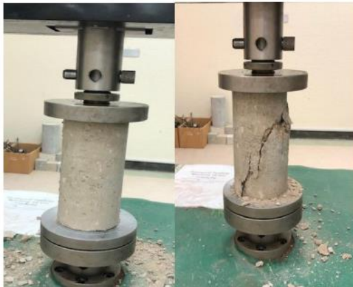
Figure 4. A cylindrical specimen under the test and after the test.