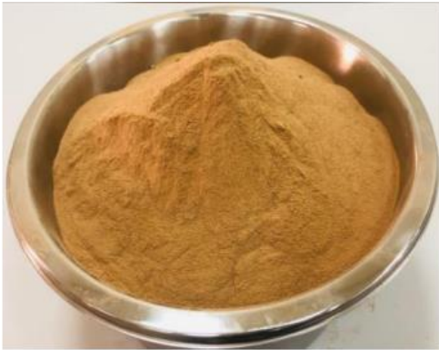
Figure 1. Sand, gravel and clay used to make specimens.

The mixture was formed from 50% sand (0.1 to 0.5 mm), 30% gravel (5 to 10 mm), 20% clay (0.005 to 0.05 mm), and then 9% cement was added by weight. Water was added based on the required moisture content for each mixture. For example, the mixture has 10% of the moisture content indicates that the weight of the added water to the mixture equals to 10% of the total weight of the rammed earth materials (i.e. total weight of sand, gravel, and clay) to the mixture.