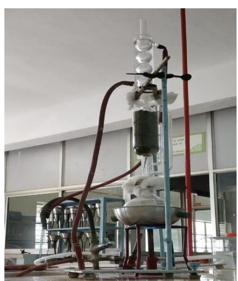
Figure 9 Extraction of tulsi

Leaves of Ocimum sanctum L. tulsi were collected from different sites washed with sterile water and 50g of tulsi was placed in the thimble of soxhlet apparatus with 50ml of water and 50 ml of ethanol over 24hr.