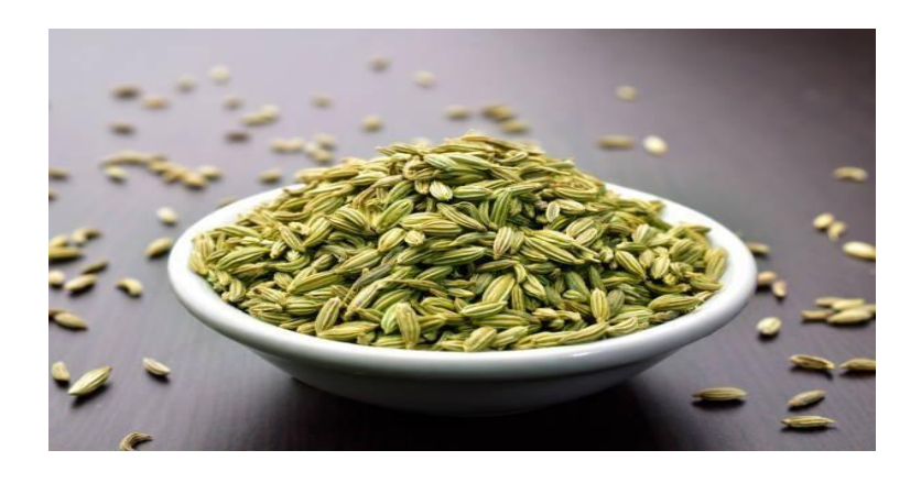
Figure 2 Fennel