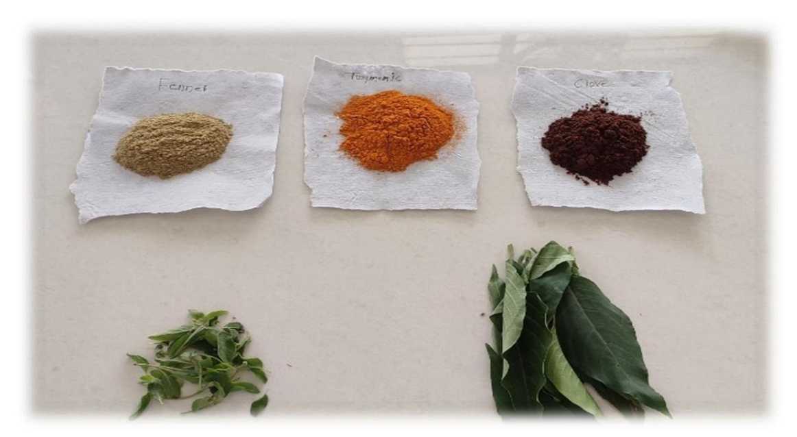
Figure 1 Herbal Ingredient