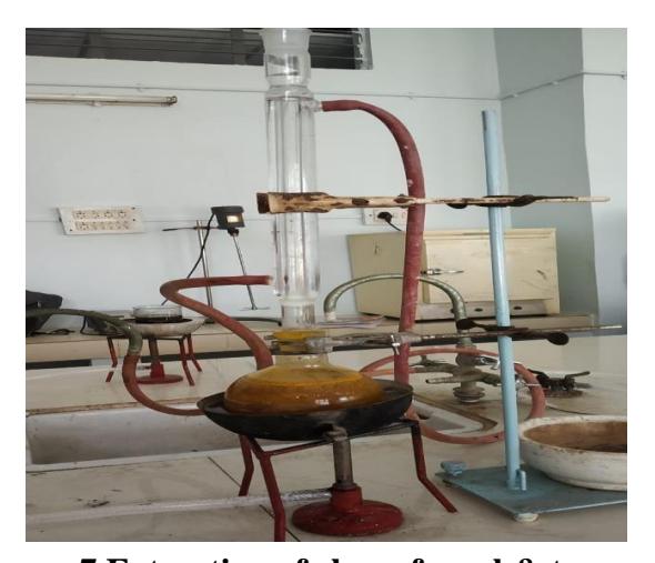
Figure 7 Extraction of clove, fennel & turmeric