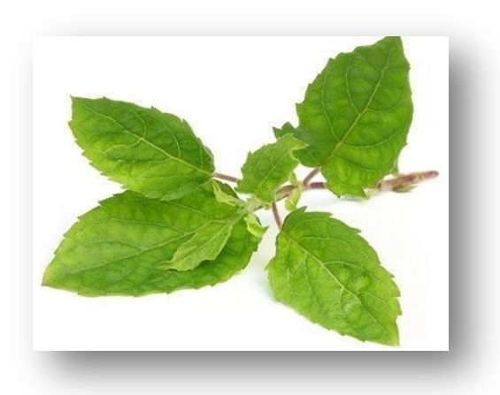
Figure 4 Tulsi Leaves