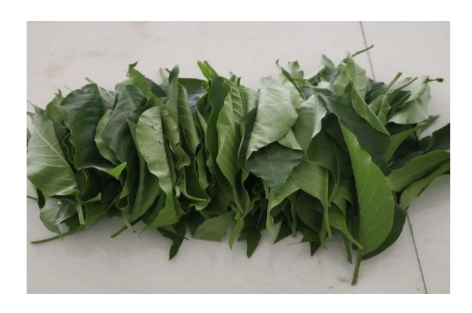
Figure 8 Extraction of adulsa

Fresh leaves of A. vasica were harvested and thoroughly washed in tap water. 50m of leaves were macerated to paste with the help of sterilized mortar and pestle with 50ml tap water and it was filtered through muslin cloth. The filtrate was kept frozen at 4°C and used in subsequent experiments as stock solution.