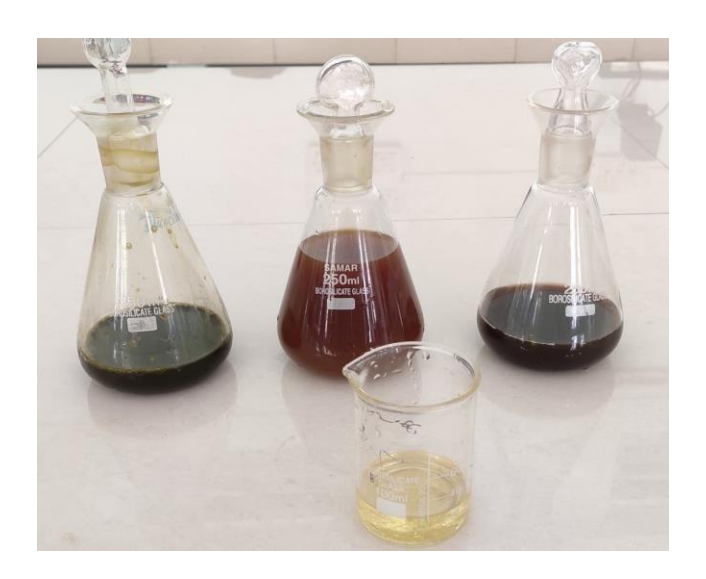
Figure 10 Extract of Adulsa, clove, fennel, turmeric, tulsi & lemongrass