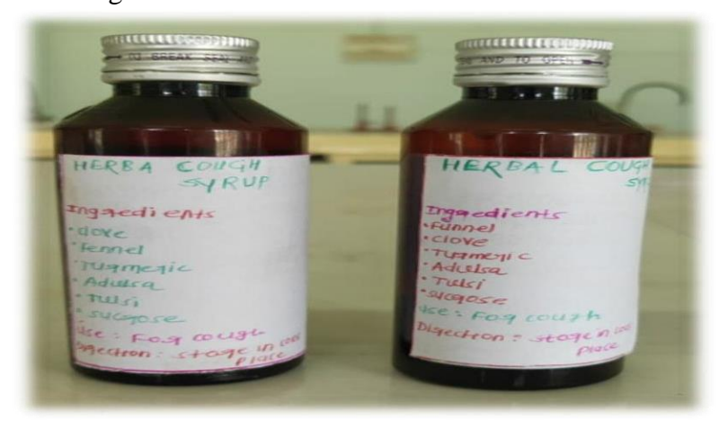
Figure 11 Formulation A & B of herbal cough syrup

Agar cup plate method was used for screening of antimicrobial activity of herbal cough syrup. The formulations were placed aseptically in cups of agar plate which was previously inoculated with culture. The plates were left at ambient temperature for 30 min. prior to incubation at 37°C for 24 hrs. The antibiotic i.e. Amikacin was used as positive control for obtaining comparative results. Plates were observed after 24-48 hrs. incubation for the appearance of the zone of inhibition. Antimicrobial activity was evaluated by measuring the diameter of zones of inhibition (millimeters) of microbial growth