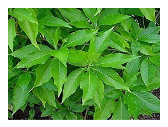
Figure 6 Adulsa Leaves