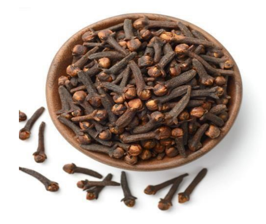
Figure 3 Clove Buds

Fennel is used as stimulant, aromatic, stomachic, carminative, and expectorant. Anethole is used in mouth and dental preparations. Fennel is used in diseases of the chest, spleen and kidney.(1) CLOVE