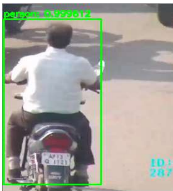
Figure 5.1 Detection of motorcycle and person (not wearing helmet)