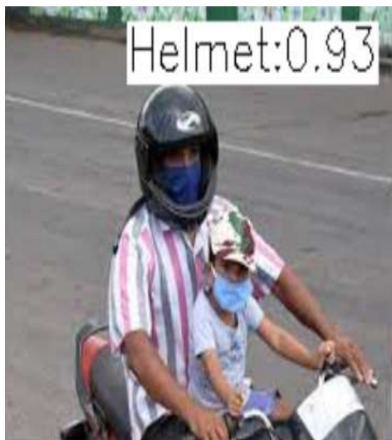
Fig.5.Detection of helmet with probability value

Motorcycle vs. non-motorcycle classifier in our experiment had a 99.78 percent accuracy rate, while safety helmet vs. non-helmet classifier had a 99.64 percent accuracy rate. As a result, the overall accuracy for finding motorcycle riders without safety helmets was 99.78\% * 99.64\% = 99.42\% .