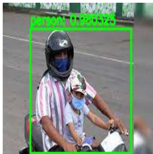
Figure 5.4 Detection of motorcycle and person (wearing helmet)