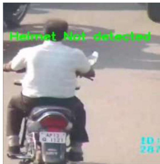
Figure 5.2 Detection of helmet

C:/Users/latha/Desktop/nameplate detection/HelmetDetection/bikes/13.png