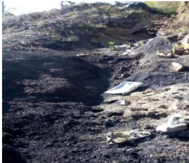
Fig 4. Field photograph showing Lignite coal from Hababo Guduru

Fincha suger Factory. The one which is in Ilamu Malole are sandwiched (interbedded) within Tertiary volcanic rock and are exposed where the upper basalt is eroded and presumably being an erosion remnant. So relatively the age of this coal is Tertiary. The seams have around 1.5m thickness beared by claystone. The other which is in Kubsa Kidame Keble toward Finca'a suger Factory are sandwiched between Mesozoic sandstone, means that both at the top and bottom there is Adigrat sandstones. Since there is still observable remains of plant fragments and the unit is not as much shine at hand spacemen for both kebeles, the quality of that coal is lignite. Shown in figure 4 below.