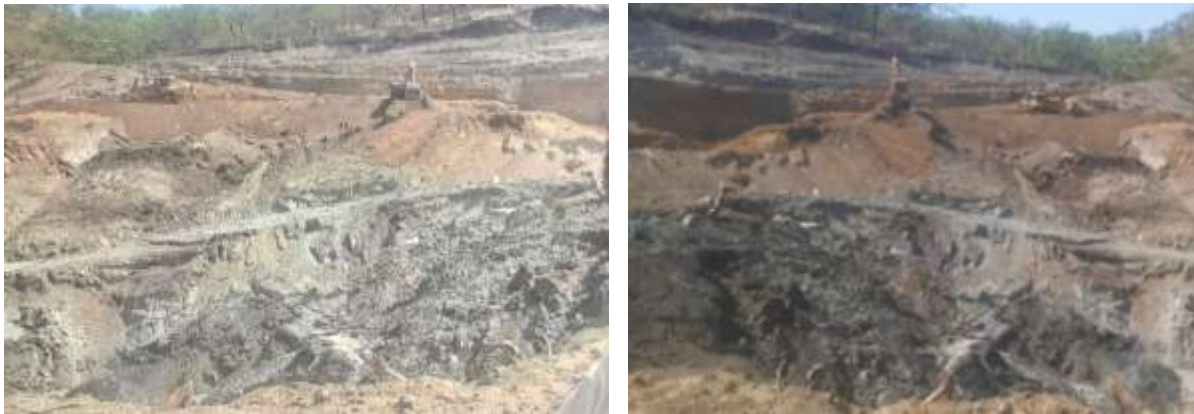
Fig 6. Shown the pattern of Open cast coal mining at Tolay area

scientific testing during mine design or the mine was never developed. This compels the owners to halt mining since it has a negative impact on the environment (land degradation and damage to life). As a result, they need scientific assistance. Scientifically, the Delbi coal has a favourable mining appeal.