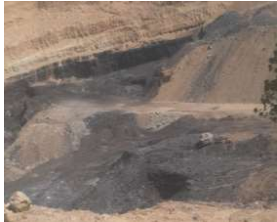
Fig 5. Coal at Tolay