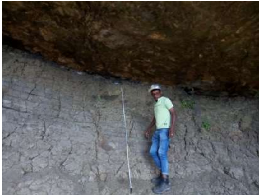
Fig 3. Coal from Gohastion area

The resource is in Gohastion woreda, Northern Showa, Oromia regional state. It sandwiched between two volcanic (Ashange basalt) both at the top and bottom. The seam has 3m vertical thickness and 30m horizontally extended. The color is gray and thin fibrous plant body remains are observable, which makes it Lignite in rank shown in figure 3.